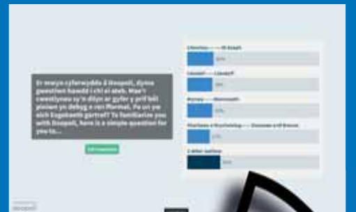
The poll results were shown in 'live time' and projected onto the screen.

Following Alex's presentation, members were invited to take part in the 'live' online poll.