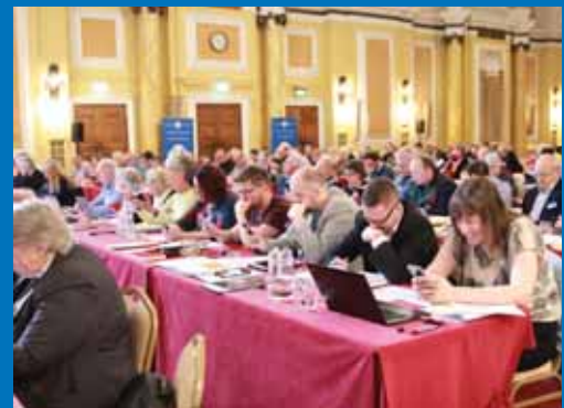
Members vote on their digital devices

The results of the poll held at the GB can be seen at http://doo.vote/gb You can see the key ideas from the group sessions and add comments at http://doo.vote/gbresults